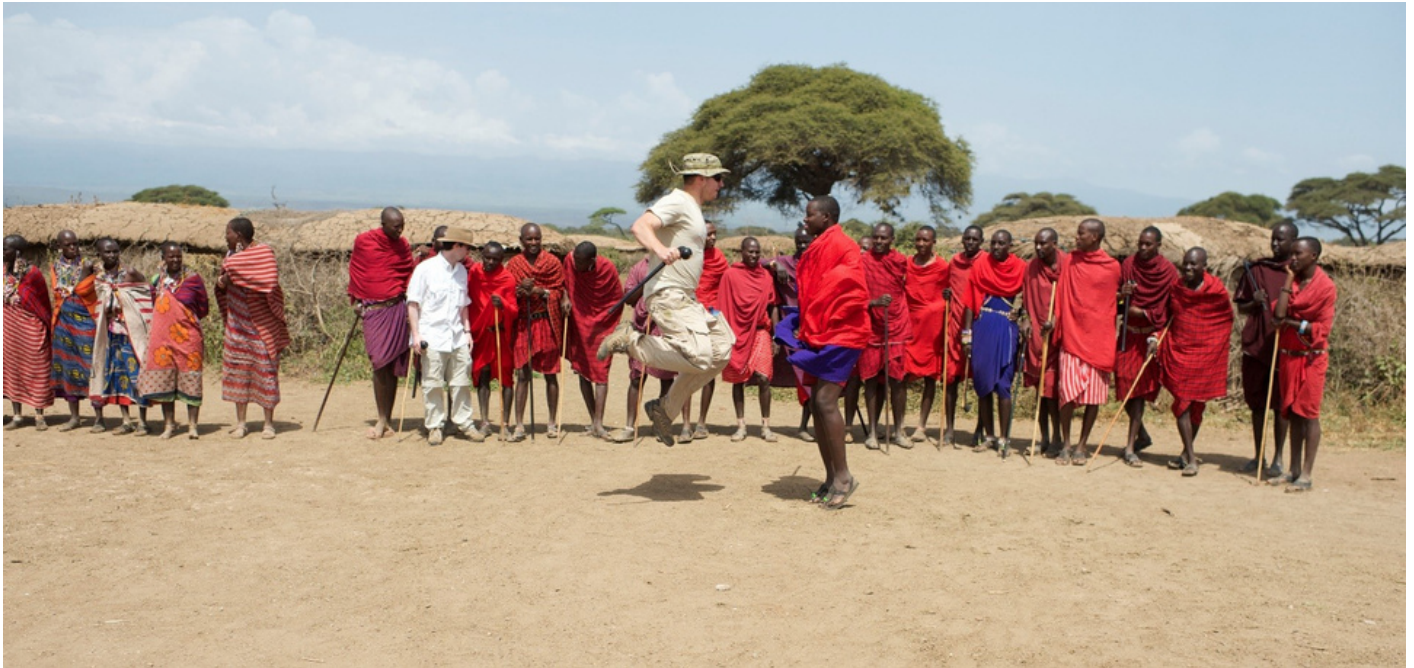
Dancing with Maasai Warriors during a Safari at Maasai Mara