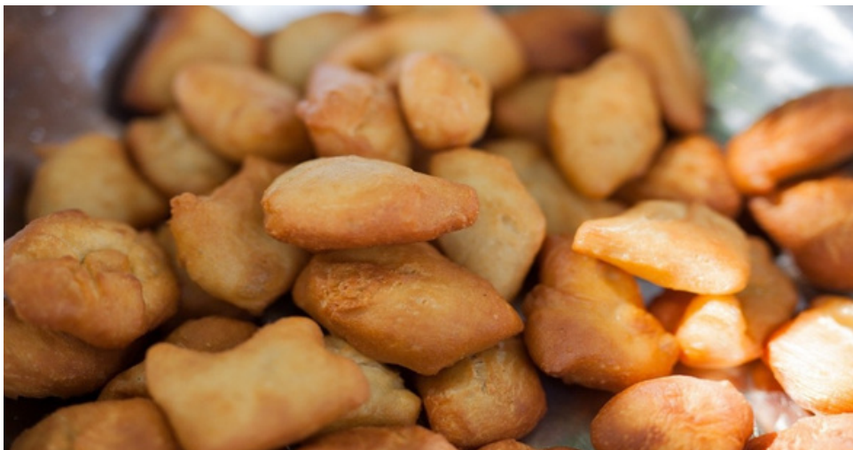
Mandazi, Kenyan donuts are a favorite on the breakfast table