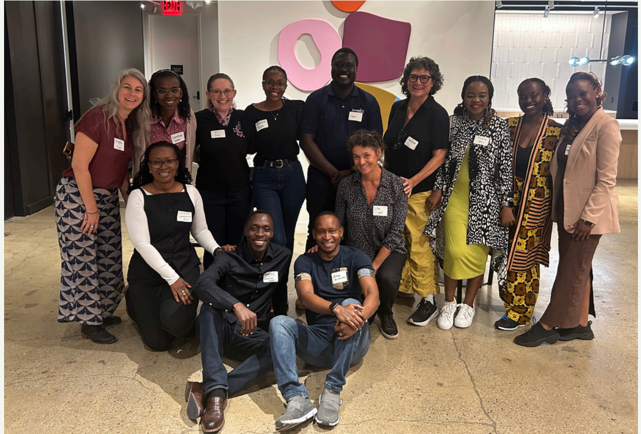
Gathering with other leaders in the Issroff Family Foundation Network

We are very grateful and appreciate the support of Mighty Ally , who made it possible for our Director to attend UNGA.